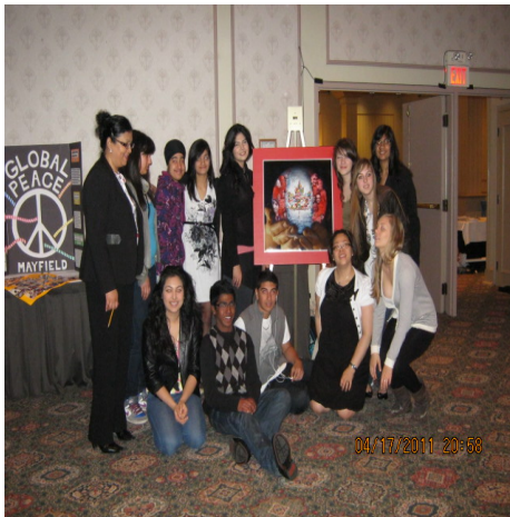
Students from Mayfield Secondary School in Peel shared their artwork on May 19.

The Mosaic Institute's "South Asian Canadian Global Citizenship Project in Peel", which the Institute launched in February 2011 in partnership with the Peel District School Board, concluded with a celebration on May 19. The project brought together more than 200 young Canadians of South Asian descent from across the Peel Region, including those from Pakistan, India, Sri Lanka, Nepal and Bangladesh, to examine the privileges & responsibilities of being a Canadian citizen, and to engage in community service projects that revitalize Canada's legacy and commitment to peacebuilding both locally and globally.