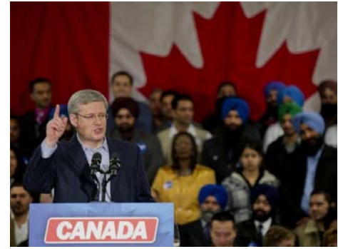
Prime Minister Harper speaking in Brampton, ON, during Campaign 2011.

No one pretends that integrating more ethno-cultural voices into policy-making will be an easy process. Different diasporic communities may have different, or even opposing, views on particular issues, and any policy inputs received must be carefully measured against Canada's core values and interests. However, the Mosaic Institute is convinced that these challenges can – and must be overcome, if for no other reason than the fact that "public policy" should, at a very fundamental level, be representative of the Canadian public in all its diversity. Ultimately, the attempt to include Canada's ethno-cultural voices in policy making, particularly in regards to foreign policy, will be a test of how serious we are about transforming our diversity into full-bodied pluralism.